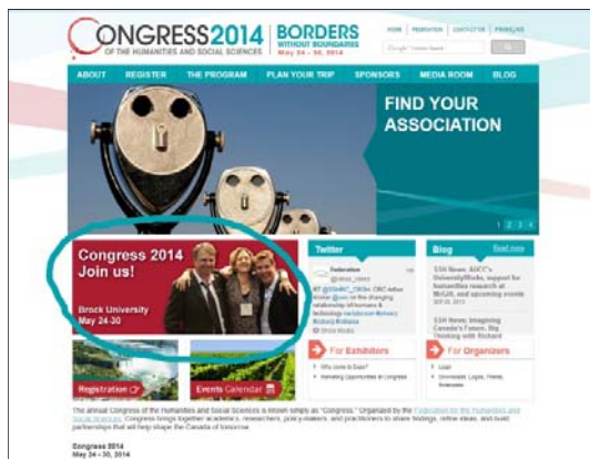
Web ad placement – Home page