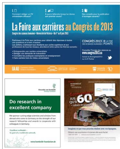
Sample: One half page ad (horizontal) and two quarter page ads (vertical).